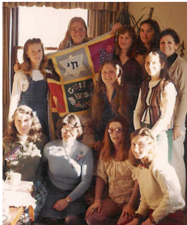
Guild of Wisconsin Midwives '83

My career has and continues to be an on-going effort requiring I be a student, teacher, and support person. I welcome any questions about my background, education, and how I manage complications. I am proud to carry on the time honored professional tradition of Midwifery. I advocate home births because I believe we must take back not only the responsibility but the process of well-being.